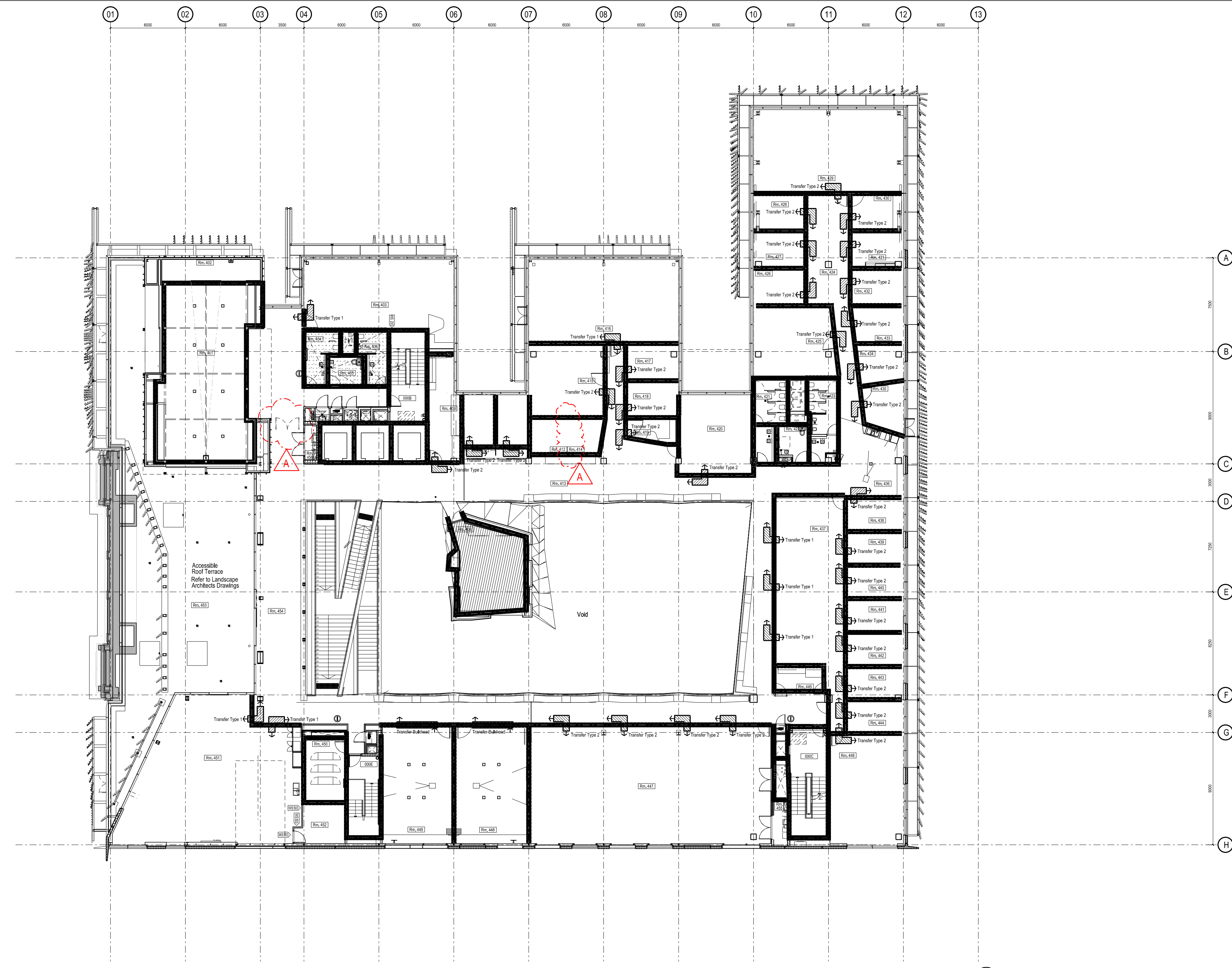
04 LEVEL 04 - AREA DIAGRAM SCALE 1:200